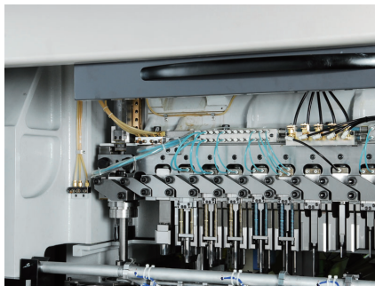
直动式垂直传递机构 Direct acting type vertical transfer