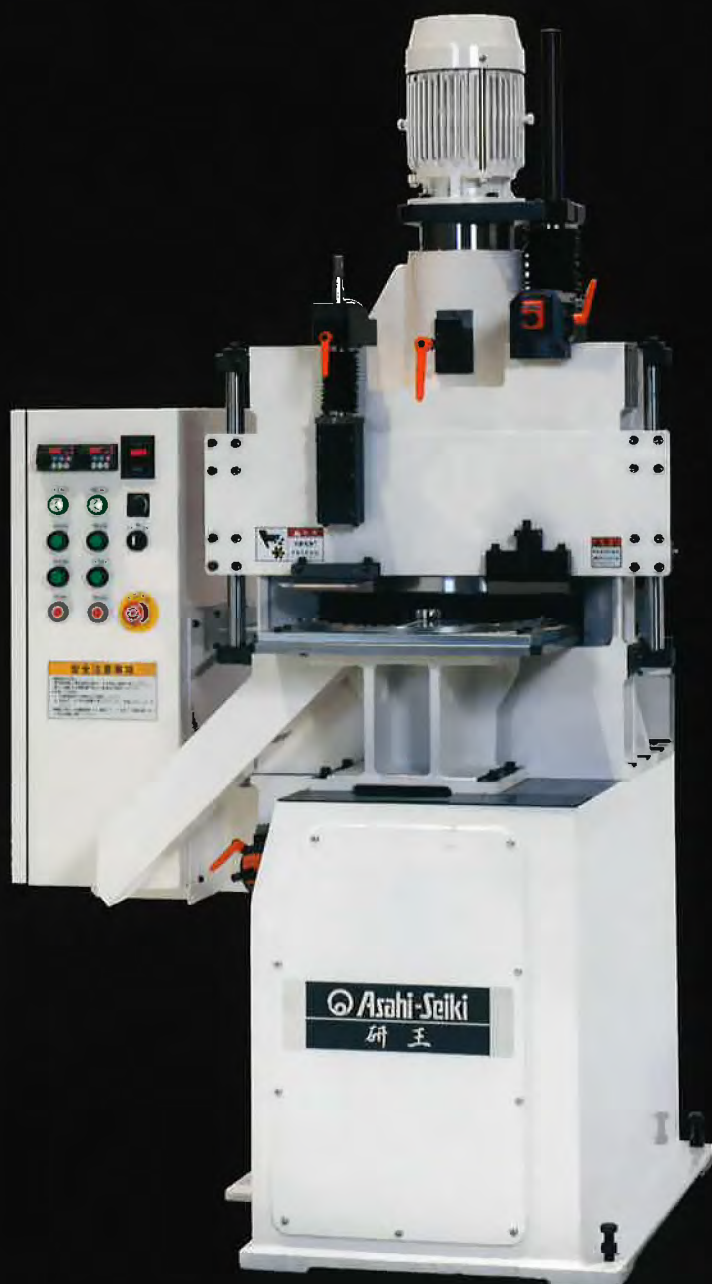
◎ Repositionable loading plate table